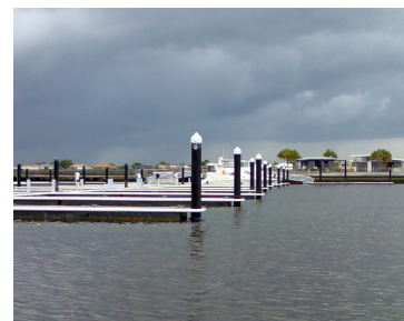
Open for Business